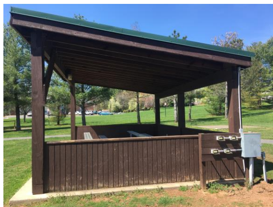
Figure 2: Existing band stand photos.